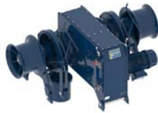
Anchor winch 40, 42 & 44 mm