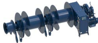
Anchor Mooring winch 40, 42 & 44 mm 80kN