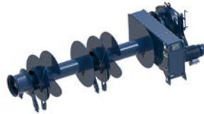
Anchor Mooring winch 52, 54 & 56 mm 100kN