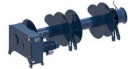
Mooring winch 100kN