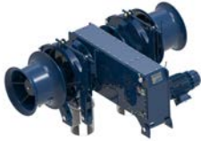
Anchor winch 52, 54 & 56 mm